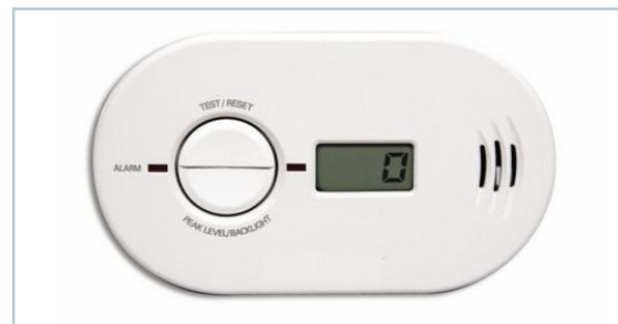
A Common Home CO Detector

Since carbon monoxide is colorless, odorless, and tasteless, the best way to alert your family is to install a carbon monoxide detector/alarm to warn of the gas's build-up.